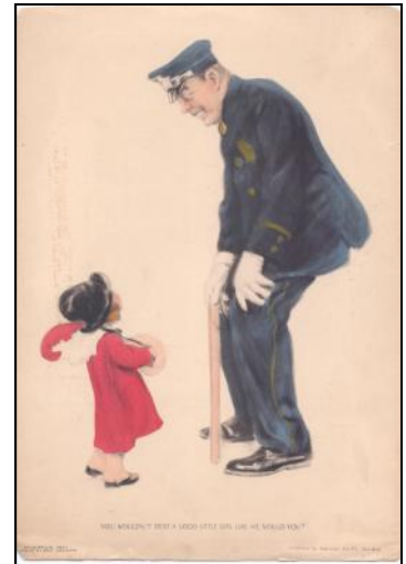
American Art Company, New York, 1913

The museum has an extensive collection of artwork, magazine ads and covers, postcards, sheet music, and the like for your enjoyment. Norman Rockwell made famous a few law enforcement related magazine covers for the Saturday Evening Post. Two come to mind in fact. In 1958 Rockwell made the cop and boy at the diner counter a very famous scene. Again in 1964 during desegregation efforts, he painted an image of a very tall US Marshal escorting a very young girl, through a gauntlet of flying tomatoes, to her classroom.