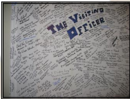
The Visiting Officer Board

The Kawasaki was then sold to the Washoe County Sheriff's Office and was used on the street and then as a training bike until taken out of service and sold. The Visiting Officer Board has been a very popular feature within the museum. The eight by eight surface has been completely covered with signatures of officers active and retired from all across America as well as many from overseas. A number of tributes have been left for officers killed in the line of duty.