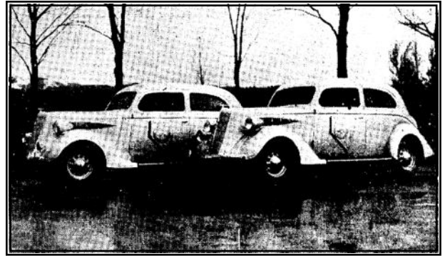
Nevada State Highway Patrol 1936 Nash ambulance patrol cars

In 1936, Nevada State Highway Patrol troopers expanded their duties greatly when the Nevada Highway Department took delivery of two new 1936 Nash highway patrol cars equipped to serve as ambulances. These two-door beauties contained both a standard and collapsible stretcher as well as first aid equipment in order to sustain life during the race to the nearest hospital. The cars were purchased through Reno automobile dealership Heidtman Motor Company. One must note the very