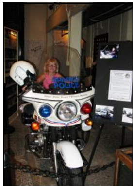
This Kawasaki motorcycle served the Sparks Police Department in 1994. Kawasaki produced police bikes from 1975 until 2005. BMW and Harley-Davidson now control the police bike market.

It has been a successful season and we have enjoyed visitors from all over the globe. We have found that the majority of our visitors are somehow connected to the law enforcement profession, either active or retired officers or even the parents or children of current or past law enforcement. Those with no connection to law enforcement have given us rave reviews and they walk away from the experience with a renewed respect and expanded knowledge of our rich history.