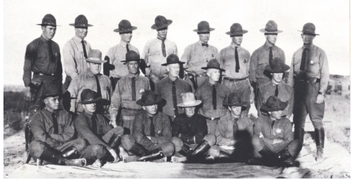
Nevada State Police, ca. 1920